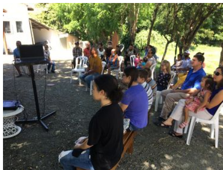
Worshipping together on Sunday mornings

house and have held services outside in the shade of some trees. We have slowly grown and now have around 30 people in attendance each week. Praise God one sweet lady came to know Christ and we have seen a lot of growth in several other individuals.