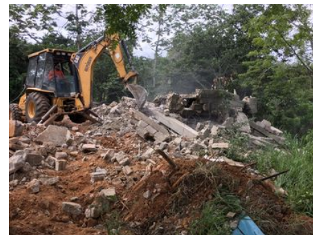
Bringing it down!

Another organization in Jarabacoa, Caribbean Mountain Academy (CMA), has been doing some community outreach by helping us with several projects throughout the summer and this fall. We have built a retaining wall along the entrance field to prevent our driveway from falling off into the baseball field. We constructed a much needed perimeter fence and now we no longer have cows grazing outside our windows every night!! We also tore down the two story building that was deemed unsound. We are currently in the middle of raising the roof of the wood shop.