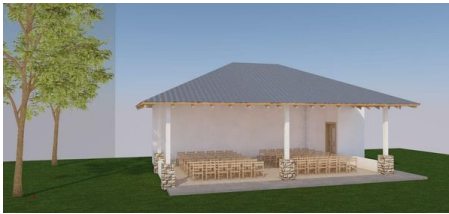
Plans for the new worship center

We have always known that the shelter of the shade tree was temporary solution for our church family. As we prayed and discussed and sought outside opinions and insights we would come up with a plan but despite efforts we didn't seem to make progress. This happened a couple different times. However, when the timing was right - God's timing - the location, the structure type, the architect, the laborers, and the funding all came together in a short time. After many attempts to find an architect, one of our first choices got back to us after not hearing from him for a long time. We met, and while he was drawing up the plans, a stranger stopped by for a tour and fully funded the projected cost!!